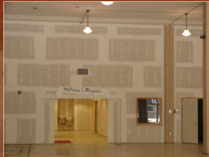
New interior walls & lighting