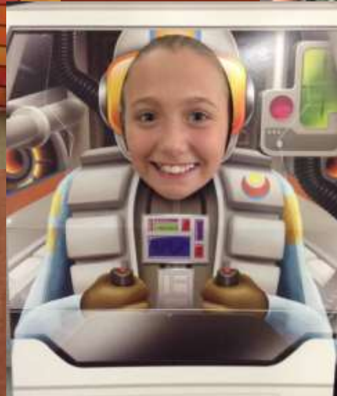
Race for Planet X