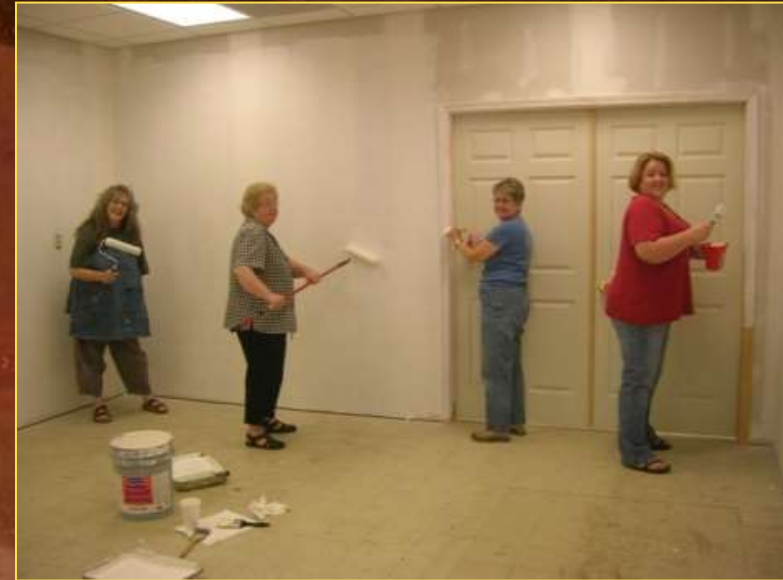
Behind the scenes areas done by volunteers with paint donated by Sherwin Williams