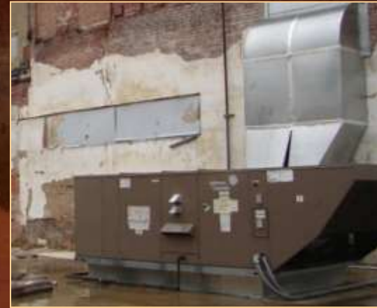
New HVAC system